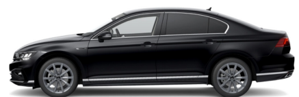
Deep Black Pearl Effect* 2T2T

Note: Oryx White is a premium pearl effect paint finish. Please see Options section for pricing information. * Optional at extra cost · Please note, the print processes do not allow exact reproduction of the paint colours.