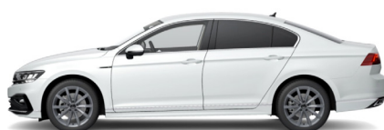
Oryx White Pearl Effect* 0R0R Note: Not available on Passat and Passat Business models