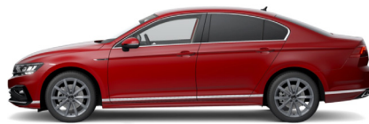
Tornado Red Solid* G2G2