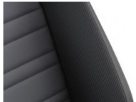
"Carbon-Flag"/Vienna (W05) Flint Grey/Titan Black (OK) Optional on R-Line models

Note 1: Some parts of leather interior trim will contain artificial leather. Note 2: The print processes do not allow exact reproduction of the upholstery & insert colours.