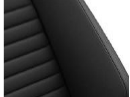
"Nappa" leather (WL7) Titan Black/Blue(TO) Optional on Elegance/ R-Line models