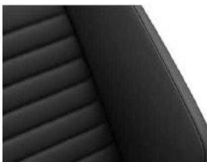
"Nappa" leather (WL8) Titan Black/Blue (TO) Standard on GTE models