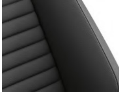
"Vienna" leather (WL1) Titan Black/Blue (TO) Optional on Business models