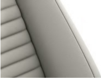
"Vienna" leather (WL1) Mistral (YR) Optional on Business models