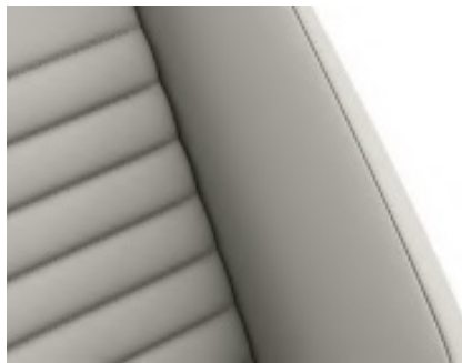
"Nappa" leather (WL7) Mistral (YR) Optional on Elegance and R-Line models