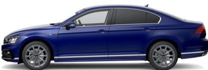
Lapiz Blue Metallic* L9L9 Note: Only available on R-Line Models