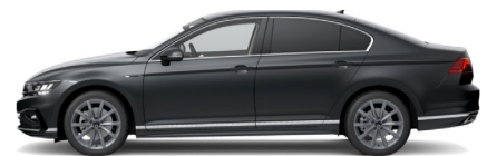
Manganese Grey Metallic* 5V5V