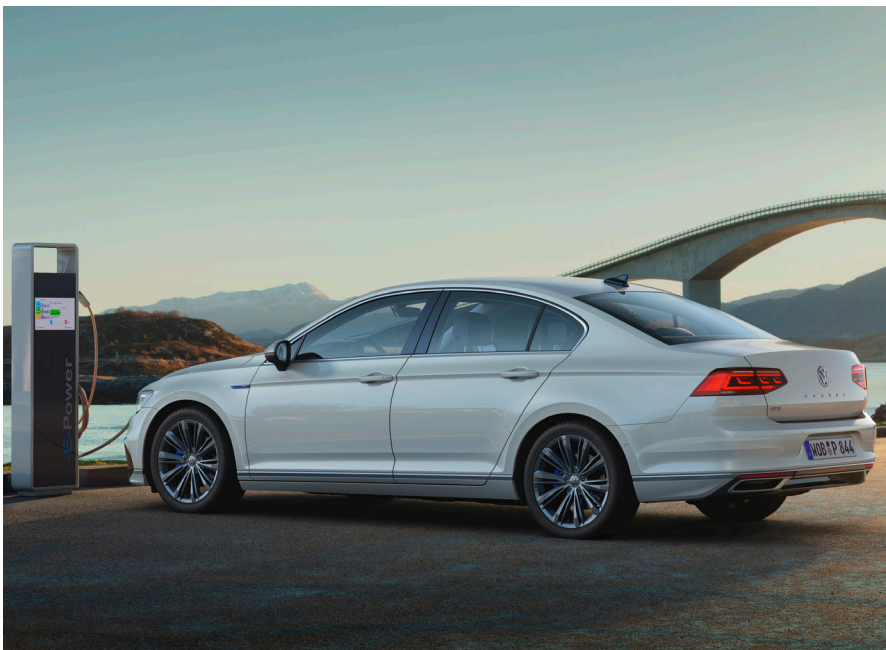
Note: The above image shows Passat GTE with optional "Liverpool" 18" alloy wheels in adamantium dark