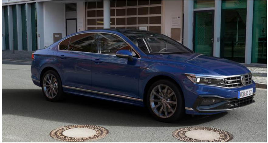
Note: The above image shows 'R-Line' in Lapiz Blue with 'Monterrey' 18" alloy wheels in Grey Metallic and optional Matrix LED package.