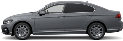
Moonstone Grey Solid C2C2