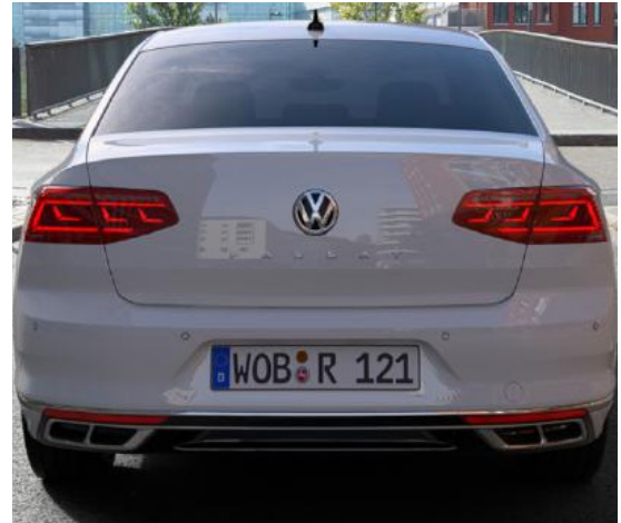
Note: The above image shows 'R-Line' Model with optional Matrix LED package.