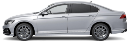
Pyrite Silver Metallic* K2K2