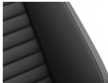
"ArtVelours"/ "Vienna" leather Titan Black/Blue (TO) Standard on Elegance/ R-Line models