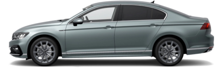
Scale Silver Metallic* 1T1T