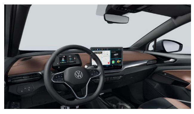
Standard selection from ID.4 PURE / PRO