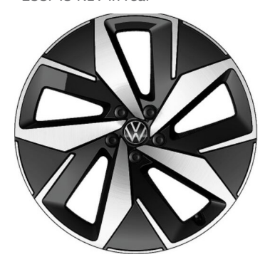
STANDARD ON ID.4 GTX

19" 'Hamar' alloy wheels 8J x 19 in front, 9J x 19 in rear Tyres: 235/50 R19 in front 255/45 R19 in rear