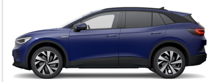
Blue Dusk Metallic<sup>1</sup>