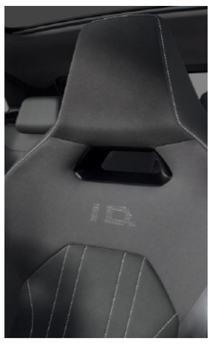
Artvelours Microfleece/Leatherette Soul/Platinum Grey Standard from ID.4 PRO STYLE Optional on ID.4 PURE / PRO

Electric controls are available via the addition of the Interior Plus Package