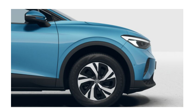
STANDARD ON ID.4 PURE PLUS Optional on ID.4 PURE 18" 'Falun' alloy wheels