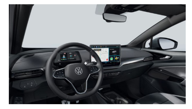
Standard from ID.4 PURE / PRO