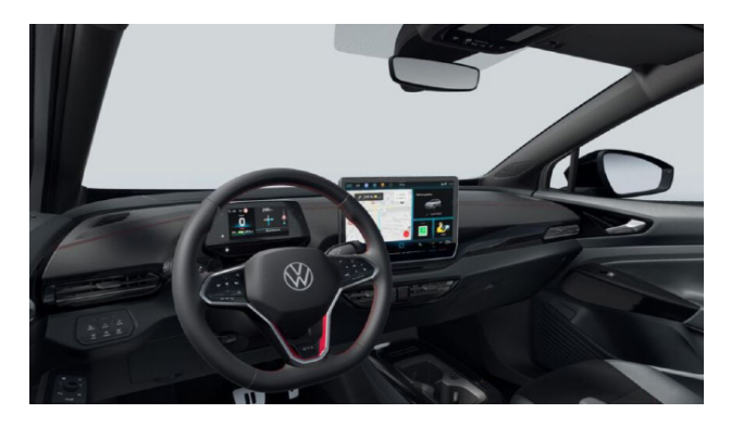
Standard on ID.4 GTX