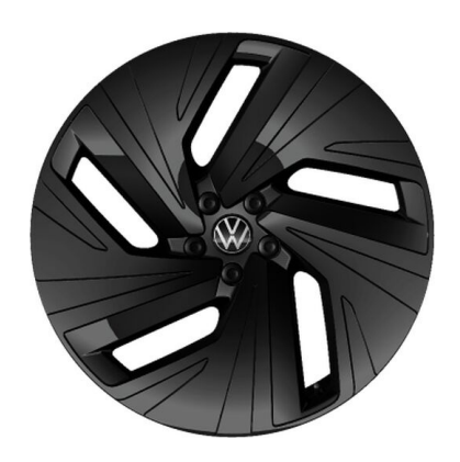
Optional on ID.4 GTX

20" 'Drammen' alloy wheels 8J x 20 in front, 9J x 20 in rear Tyres: 235/50 R20 in front 255/45 R20 in rear