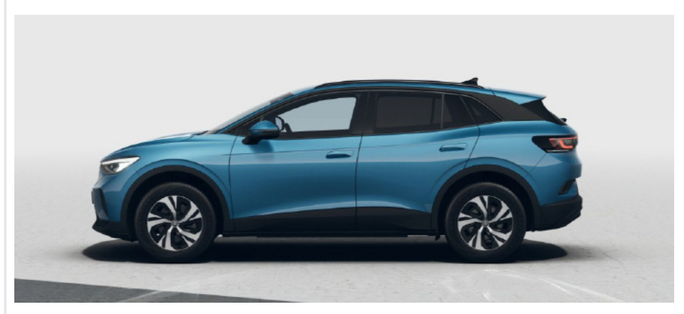
The above specifications are for information purposes only as our products are continually updated and changes may be made to the specifications at any time. If you require any specific feature, you must consult your local dealer who is regularly updated with any change in specification. Specifications are subject to change without notice.