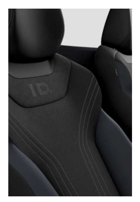
Artvelours Microfleece/Leatherette Soul/Platinum Grey Standard from ID.4 PURE / PRO

Electric controls are available via the addition of the Interior Plus Package