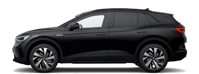
Grenadilla Black Metallic¹