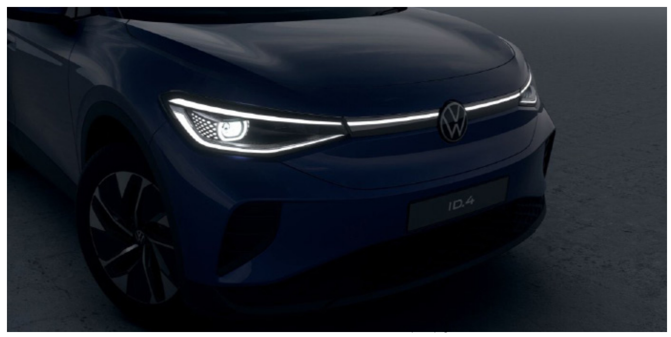
The above specifications are for information purposes only as our products are continually updated and changes may be made to the specifications at any time. If you require any specific feature, you must consult your local dealer who is regularly updated with any change in specification. Specifications are subject to change without notice.