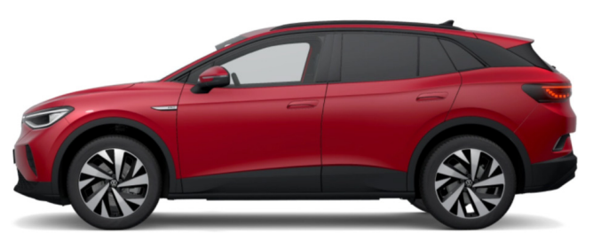
King's Red Metallic<sup>1</sup>