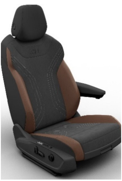
Artvelours Microfleece/Leatherette Soul/Florence Brown Standard from ID.4 PURE / PRO

Electric controls are available via the addition of the Interior Plus Package