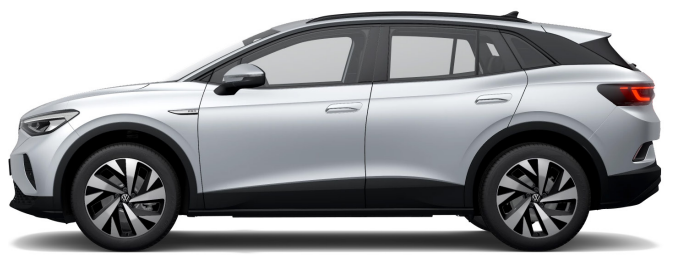
Scale Silver Metallic<sup>1</sup>