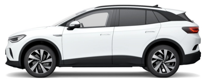
Glacier White Metallic<sup>1</sup>