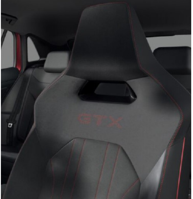
GTX Art Velours/Leatherette Soul/Flash Red Standard on ID.4 GTX PLUS Optional on ID.4 GTX

Note: Some parts of leather interior trim will contain artificial leather. Note: The print processes do not allow exact reproduction of the upholstery & insert colours.