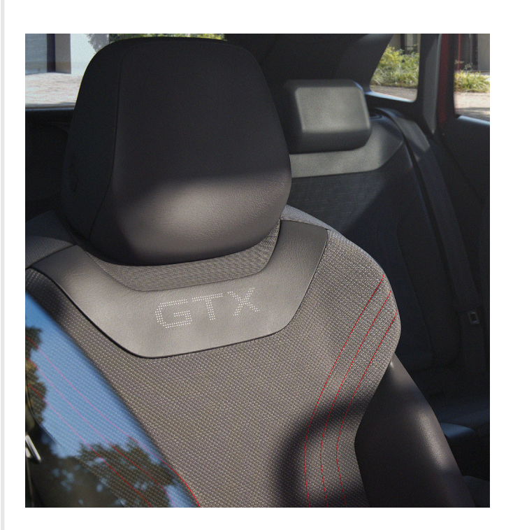
GTX Cloth/Leatherette Soul/Flash Red Standard on ID.4 GTX